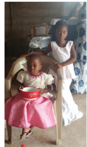
Ghanaian Easter Dresses

But there is also the glorious truth that we are all blessed because we have heard the witness of those who had beheld the risen Lord, watched Him eat a fish, and who had heard His words of peace. And, having heard the Word, we have believed. We have not seen with our eyes. But we have heard the message passed down from the apostles whose very purpose was to see the risen Lord and to make His resurrection known (Acts 1:21-22). Thomas should have believed on the witness of the other apostles; so it is with us. And hearing, we confess that faith. We don't know when the Lord will return and our eyes will no longer be denied their visual feast of the risen Lord. But until that day, we are to join in Thomas's life-changing confession: Jesus is our God and Lord! Even now we bow in adoration of Him whom we have heard with our ears but our eyes have not yet seen. But one day we will see Him. And we will again repeat in even more joyous tones: Christ has risen! He has risen, indeed! Alleluia!