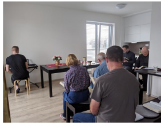
The Divine Service in Olomouc